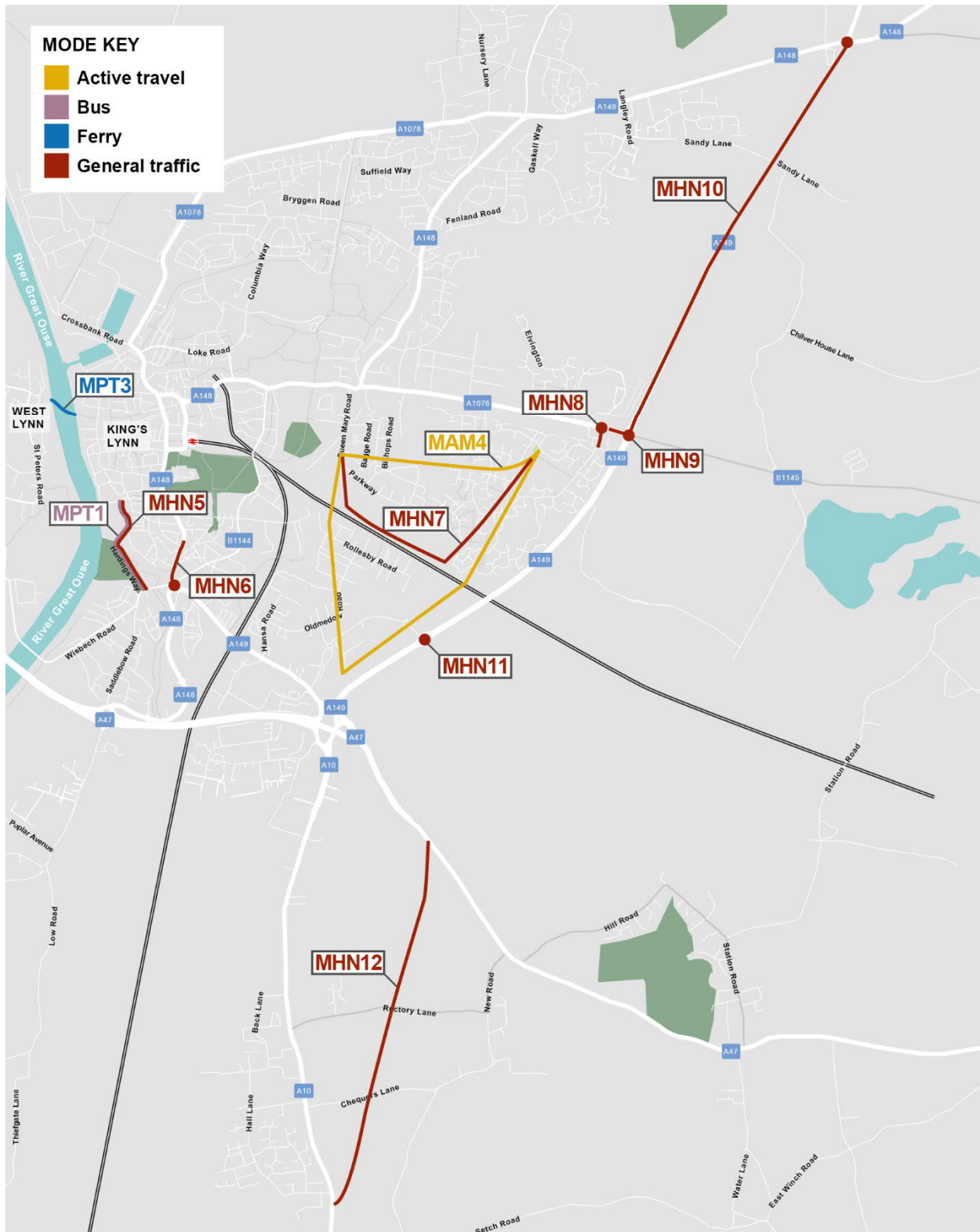
Figure 2 - Transport Strategy Medium Term Options

The locations of the Medium-term options are provided in the figure 2, detailed in tables 6 to 8.