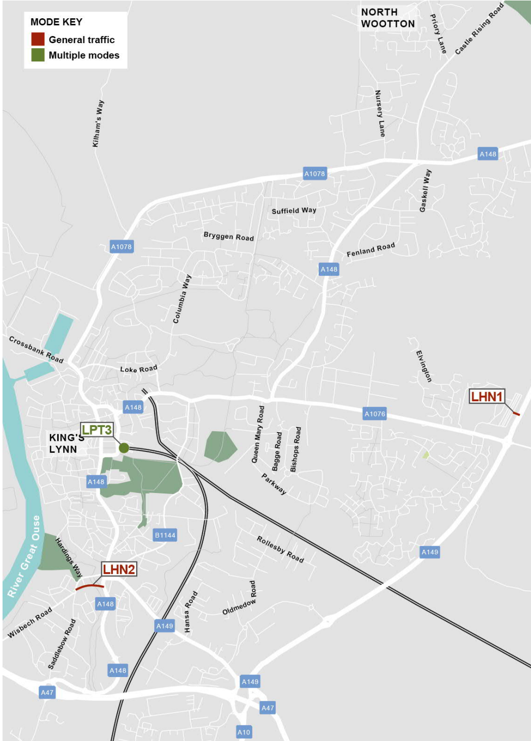
Figure 3 - Transport Strategy Long Term Options

The locations of the Long-term options are shown in the figure below, detailed in tables 9 to 10.